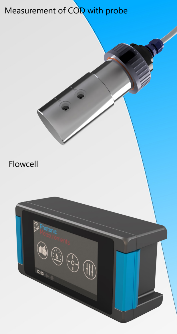
Touch Screen IP65 Monitor